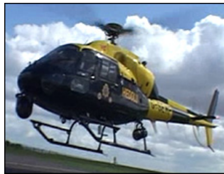
The helicopter crew spotted the aircraft earlier this month

A police helicopter crew has spotted what is described as an unusual aircraft in the Vale of Glamorgan.